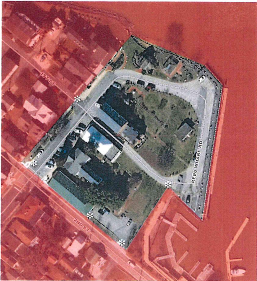
* locations for signs limiting the consumption of alcohol